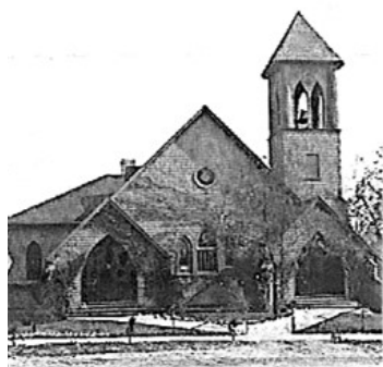
April 5th, 1895