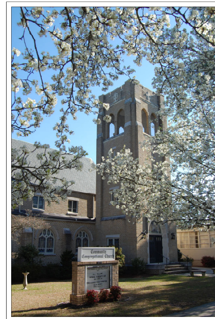
The Community Congregational Church, UCC Established in 1895